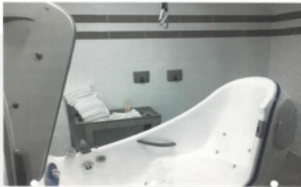
Figure 1: banana tub

On July 16, 2017, three staff members were assisting Patient C with their bath in a tub nicknamed the "banana tub" because of its shape; it resembles a banana when held horizontally. It is narrow, has a side door to assist patients with getting in and out as well as a seat inside the tub. When filled, water will come as high as the door and just above the seat. The tub can then be reclined so that water reaches the patient's abdomen to give them the feel of getting a traditional bath (see figure 1).