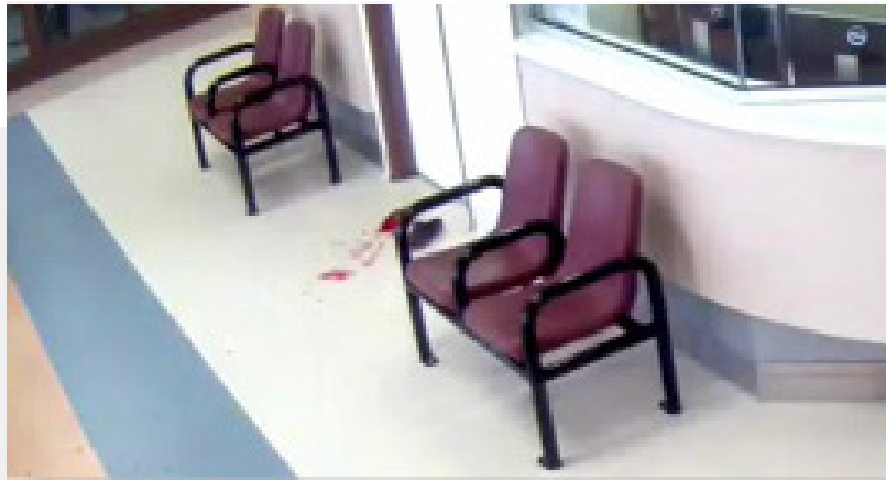
Figure 2: blood stain following an incident

Most incident reports prepared by staff who were present during the altercation say that Patient D violently punched the door, threatened to hit the forensic attendant inside the nurses' station, and that the patient strongly resisted being restrained. Most incident reports were signed in the beginning of August; in some cases, it was two weeks after the incident. One employee mentioned in their report that they were unsure about the sequence of events during the incident. A forensic attendant reported that Patient D hit them in the face with their right elbow which was covered by a cast while another said the patient tried to bite them.