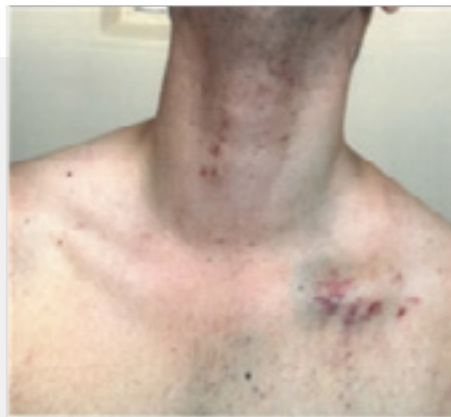
Figure 5: patient injuries

The investigation report says that at 10h35, the physician was in the unit when they were asked about Patient E’s injuries. The physician says they were never contacted on the day of the incident to assess Patient E’s status. The evaluation showed bruising and scratches to the patient’s left clavicle and ear as well as to their throat (as seen in Figure 5). Patient E also mentioned having soreness in their tailbone. Following the physician’s evaluation, Patient E was given the opportunity to file a complaint with the RCMP. An officer attended RHC that same afternoon to look into the matter and took a statement from the patient.