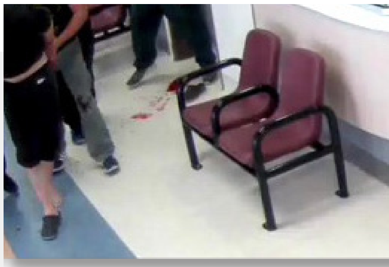
Figure 3: knee blood stain on the forensic attendant's pants

Video footage corroborates some of this employee's declaration. The forensic attendant who initially intervened in the nurses' station can be seen pointing a finger at Patient D while they are talking to the patient. Patient D did not grab the forensic attendant's shirt collar as was mentioned in the nurse's report. After Patient D hit the door, they took a step back, had their hands down and did not appear to be acting aggressively. At this point, a forensic attendant came from behind Patient D without their knowledge and took them down by the throat. Other forensic attendants then intervened and a "Code White" was called. A forensic attendant can be seen raising a fist towards Patient D with a punching motion. Seconds later, this same forensic attendant is seen making the movement of giving three knee strokes towards Patient D.